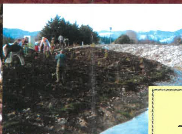
Volunteers planting the area behind the Tavern after landscaping.