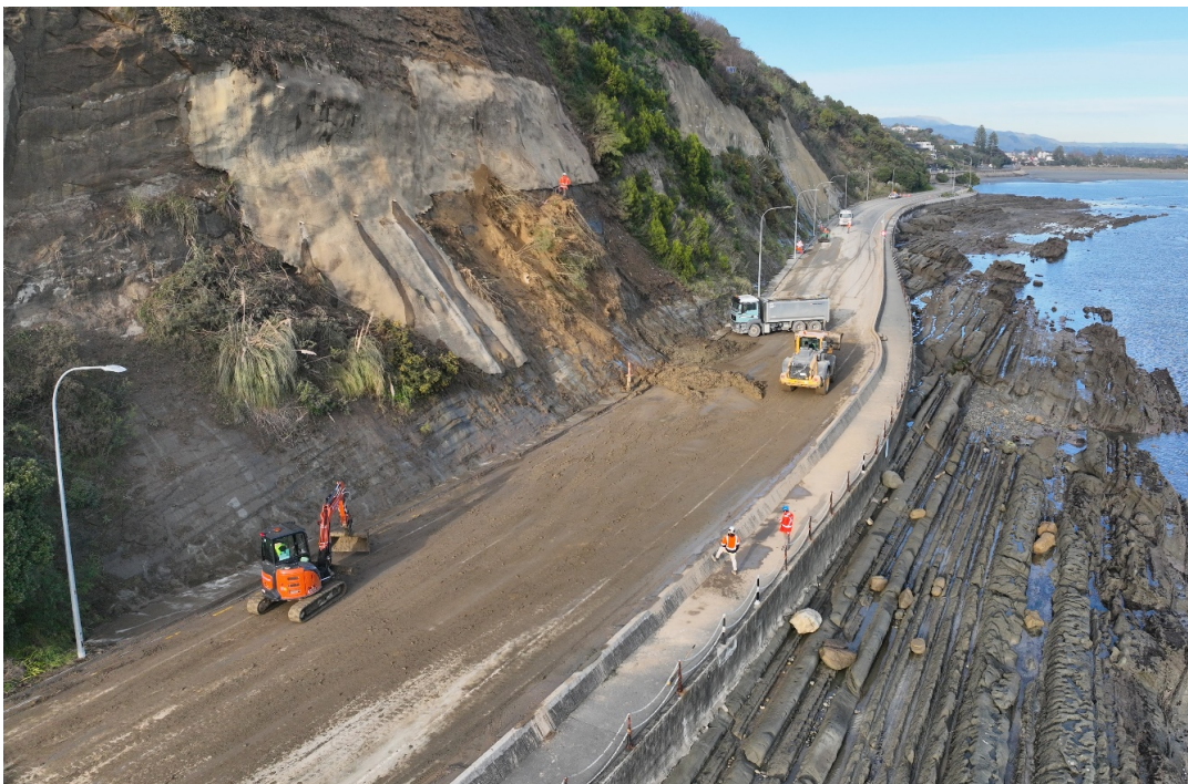
(File image: Slip debris removal, SH6 Rocks Road. July 2025)

"It is simply not safe to have vehicles, cyclists, or pedestrians below the cliff while this is being done," Mr Service says.