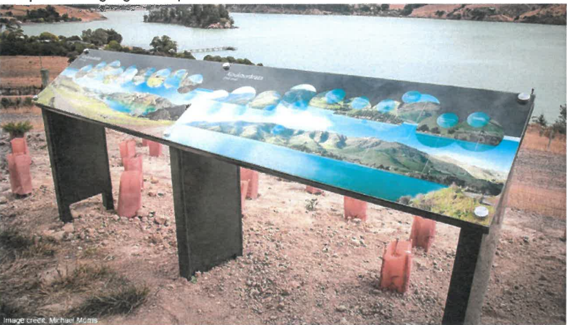
Interpretation signage example